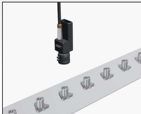
MVS Camera is set-up to inspect proper inside and outside diameter of an automotive part.