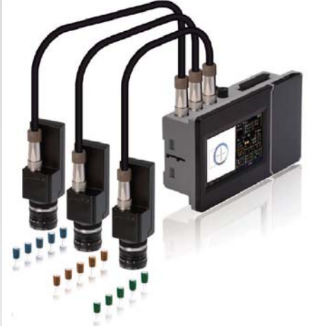
3 MVS cameras are set-up to inspect 3 separate lines. Each camera is set to verify the color and inspect the proper orientation of the capacitor.