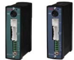
2 AND 3 POINT CONTROLLERS

The new line of position controllers from IAI continues to incorporate the force and position control of previous lines but at a reduced implementation cost. These controllers are also sold with an IP53, dust-proof rating for installation on the work floor near the actuator, similar to the installation of an air valve.