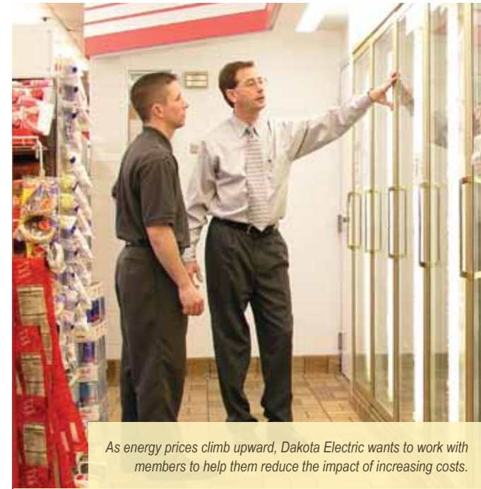
As energy prices climb upward, Dakota Electric wants to work with members to help them reduce the impact of increasing costs.

4300 220th Street West Farmington, MN 55024 651-463-6212 | www.dakotaelectric.com