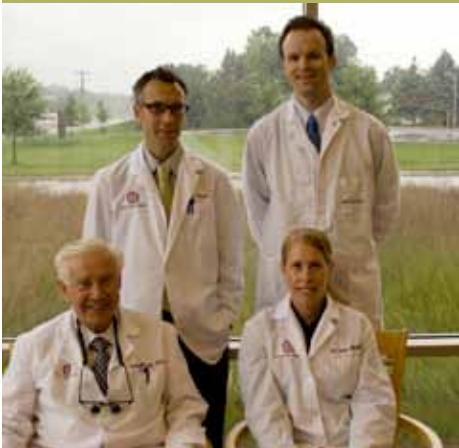
The dentists at Dalseth Family and Cosmetic Dentistry in Apple Valley enjoy the comfort and cost savings of a geothermal heat pump.

Whether you have 15 minutes or two hours, stop by when it's convenient and let us help you find a way to save.